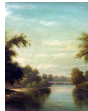
"Lehigh Valley Landscapes" on exhibit through December 21, 2012

accompanied by an art contest. We will continue to accept entries until May 31 (or until we fill the space). The entries will be judged in the summer and winners announced on August 15 at a "Summer Soiree" on the Archives' patio including refreshments and live music - open to everyone! We will award cash prizes for the three winning entries. More information and entry forms are available on our website.