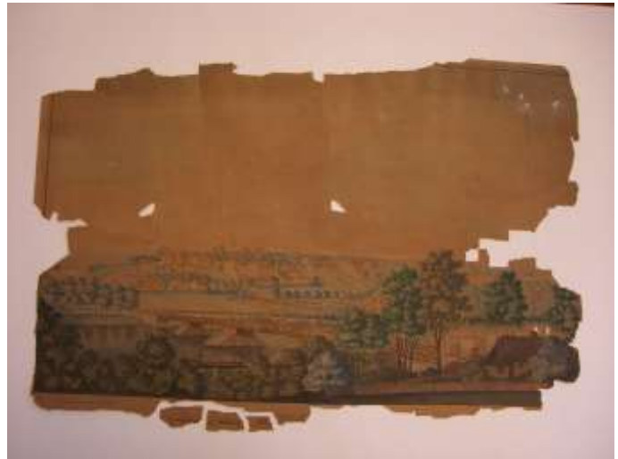
View of Bethlehem (1794) prior to restoration